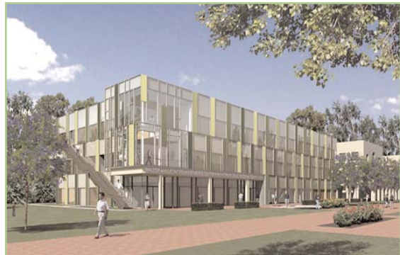
Walter and Leonore Annenberg Center for Information Science and Technology

On December 7, 2007, Caltech broke ground on the Walter and Leonore Annenberg Center for Information Science and Technology, a new home for the IST initiative’s professors and students. It was partially