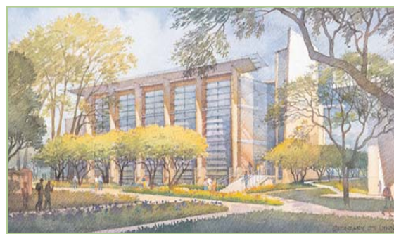
Warren and Katherine Schlinger Laboratory for Chemistry and Chemical Engineering