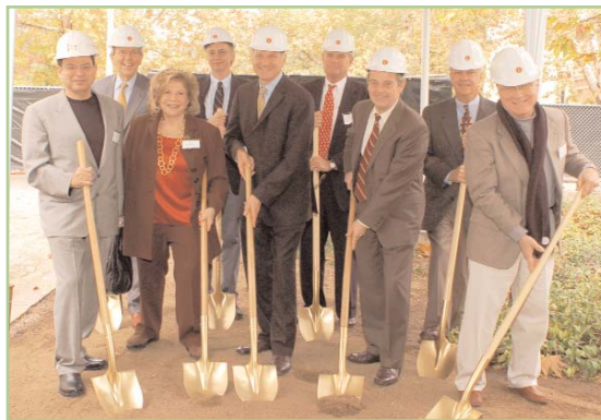
Groundbreaking for the Annenberg Center

funded by a $25 million gift from the Annenberg Foundation. At the groundbreaking, Wallis Annenberg commented: “As a nation, as a society, we don't do enough to fund basic scientific research. Even on the brink of such major advancements, it is too often a monetary afterthought, and