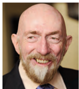
Kip Thorne (BS '62)